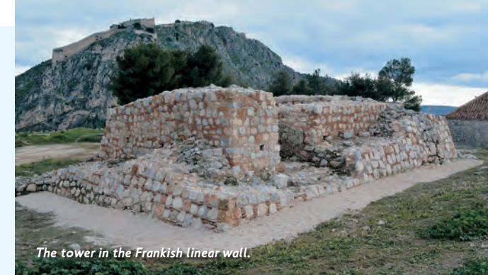
The tower in the Frankish linear wall.