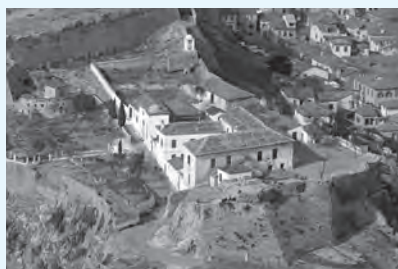
The Kapodistria's hospital area in the early 20th century.

Nafplio becomes the seat of the Turkish governor of Peloponnese. The Ottoman traveler Evliya Çelebi who visited the town in 1668 delivers that within the fortress of Acronauplia existed lots of modest houses and a big mosque, "Fethiye Camii", on the top of the hill, originally a Christian church dedicated to Saint Andreas.