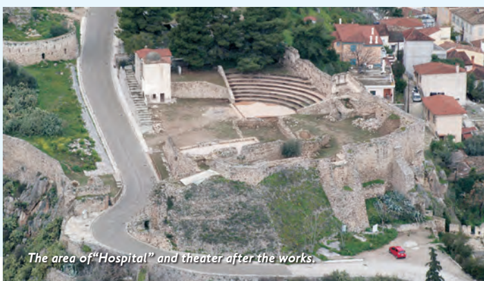
The area of "Hospital" and theater after the works.

With these works done to this extent the degraded area of Acronauplia became an archaeological place with free access to the public and full placement among the public areas (roads, open spaces e.t.c.) of the peninsula.