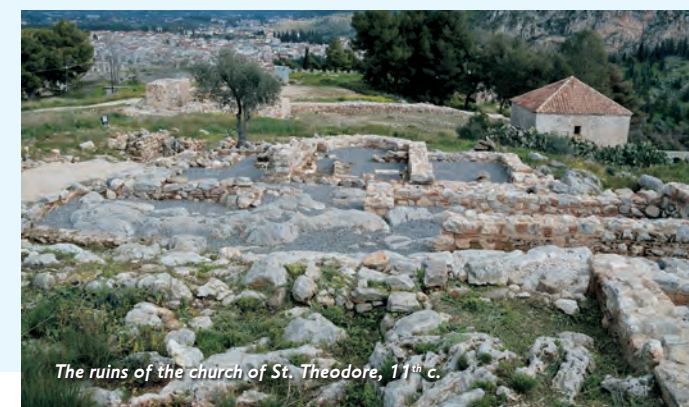
The ruins of the church of St. Theodore, 11 th c.