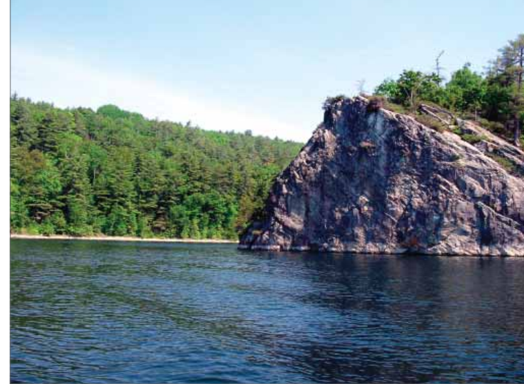
(I) Barn Rock Harbor, NY

On the left, inside the harbor is a pile of rubble, the remains of a dock (J) for a granite quarry. Large cut blocks can still be seen on the land above. The quarry brought granite down to the barges by carts on rails, using a pulley system of counterweights in the empty cart. On January 15, 1891, ice coated the cable, causing brakes to fail and the cart to crush and kill several workers, including members of the owner’s family. The quarry closed. A sunken barge still remains beneath the harbor.