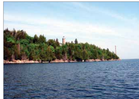
(P) Split Rock lighthouses, NY