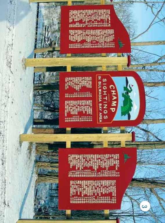
Champ Sightings display board, Port Henry, NY