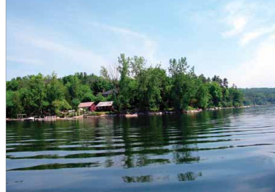
(B) Furnace Point, NY