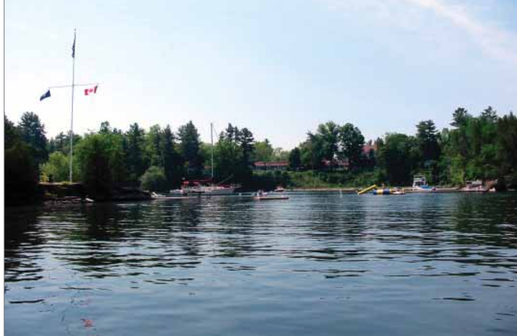
(XX) Basin Harbor, VT

The Basin Harbor Club occupies the same stretch of forested, rocky shoreline as the Lake Champlain Maritime Museum. The privately-owned, 700-acre resort is surrounded by beautiful gardens with two excellent restaurants, a grass air field, tennis courts, canoe