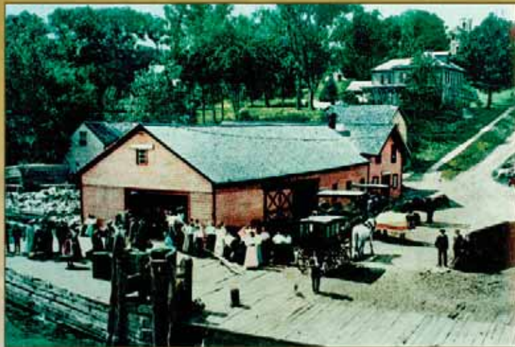
Westport, NY, Dock House, post card, circa 1910