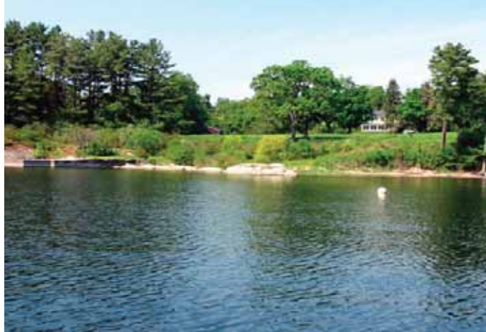
(E) Rock Harbor, NY

In 1985 Vermont created Lake Champlain’s Underwater Historic Preserve program to protect shipwrecks while providing divers with reasonable access to sites. To prevent damage caused when anchoring, divers tie their boats to the large yellow buoys that mark shipwreck locations. Divers must register to dive on these sites at participating dive shops and marinas such as Westport Marina. Just north past Rock Harbor, a yellow bouy (H) marks New York State’s underwater preserve, established in 1998. The hull of the steamer, Champlain II, lies below the surface in 15 to 35 feet of water. The pilot, under the influence of morphine used to treat his gout, fell asleep at the wheel. The boat ran aground at full throttle, thrusting up onto the rocky shore. All of the passengers