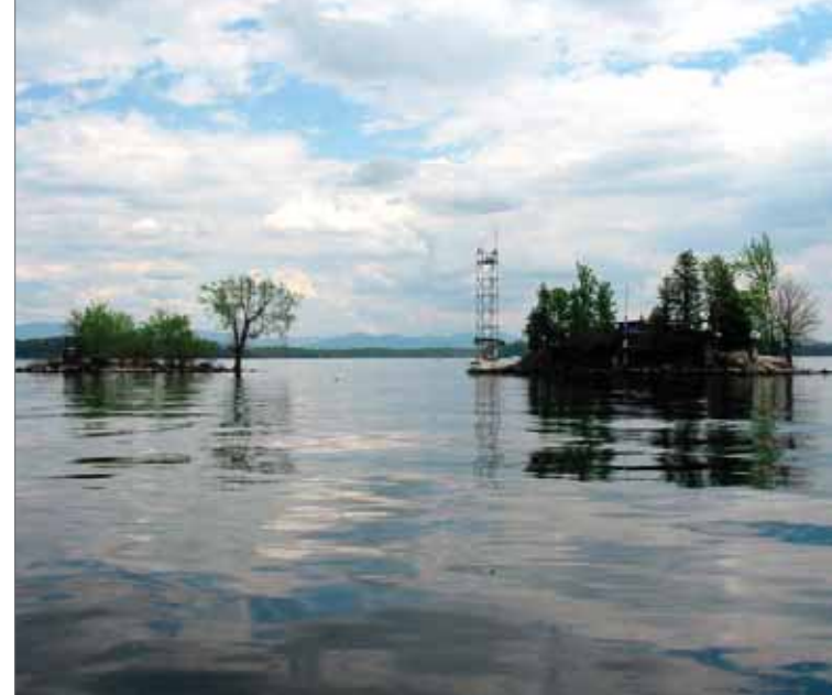
(N) Diamond Island, VT

Yellow dive buoys near Diamond Island indicate the location of two shipwrecks in Vermont's system of underwater preserves. The buoy closest to the island marks The Diamond Island Stone Boat , a submerged canal boat still loaded with large stone blocks. Today, much of the ship is encrusted with zebra mussels. The buoy located south of the island marks the schooner, Water Witch , one of Lake Champlain's most important shipwrecks. Built as a steamboat in 1832 in Fort Cassin (O) at the mouth of Otter Creek, it was converted from steam to sail in 1836. The Water Witch served for 30 years as a freight carrier until April of 1866, when, loaded with Port Henry iron ore, it sank in an early season gale. Captain Thomas Mock and his family were thrown into the icy water. Essex Captain Edward Eaton saved all but one child, Rosa, who was lost.