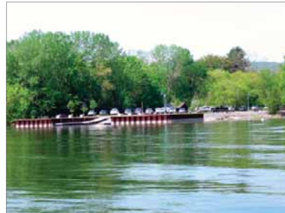
(A) Public Boat Launch, Westport, NY

A second furnace was located on what is, today, the Westport Yacht Club’s (AA) concrete dock. Known as a “puddling furnace,” the Norway Furnace converted pig iron to wrought iron for use by blacksmiths.