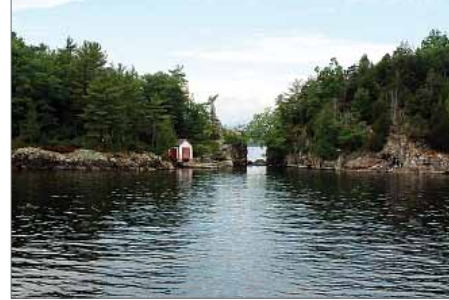
(Q) Split Rock, NY

At the very end of Split Rock Mountain are two lights (P). The original light tower was built in 1838 on a location chosen by Congressman Reuben Whallon, for whom the adjacent bay is named. A 39-foot octagonal tower of rough-hewn blue limestone replaced the original tower in 1867. Located 100 feet above the lake, the light was visible 18 miles away. The lighthouse was decommissioned in 1928. The property was sold and converted into a private home, which it remains today. For more than 70 years, the automated replacement beacon mounted atop a steel skeleton structure guided boats at night. In 2002, as part of a movement to restore historic lighthouses on the lake, the stone tower light was renovated and re-lit by the U.S. Coast Guard.