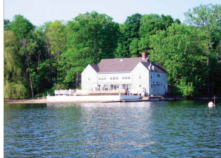
(AA) Westport Yacht Club: Le Bistro du Lac

Crowned by the beautiful Adirondack Mountains, the lakeside village of Westport, formerly named Bessboro after Elizabeth, daughter of founder William Gilliland, was developed on a land grant from King George III of England. Had Gilliland sided with the colonists during the Revolution, the town might still retain the name. The French called Westport Baies des Rocher Fendus or Bay of the Split Rock because it was the first big bay the French would have approached after passing Split Rock. On the other hand, the English, sailing from their stronghold in Crown Point, called this town Northwest Bay (DD). In 1815, the name Westport was adopted reflecting the importance of the lake to its residents. Westport, where Lake Champlain meets the Adirondack Mountains, was once a connection for steamers to stagecoaches, and now, from pleasure craft to Amtrak, or from rental car to the bus or an airport.