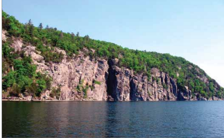
(K) Palisades, NY

In the next bay, Ore Bed Harbor (M), rock slides cascade down to the water's edge. The dramatic flows of broken granite are actually talus left from mining magnetite iron ore in the 1860s. A mining village with houses and a store were situated on top of the mountain, and a long wooden stairway reached down to the lake. Archaeological remains from the days of the mining operation still exist on land and underwater.