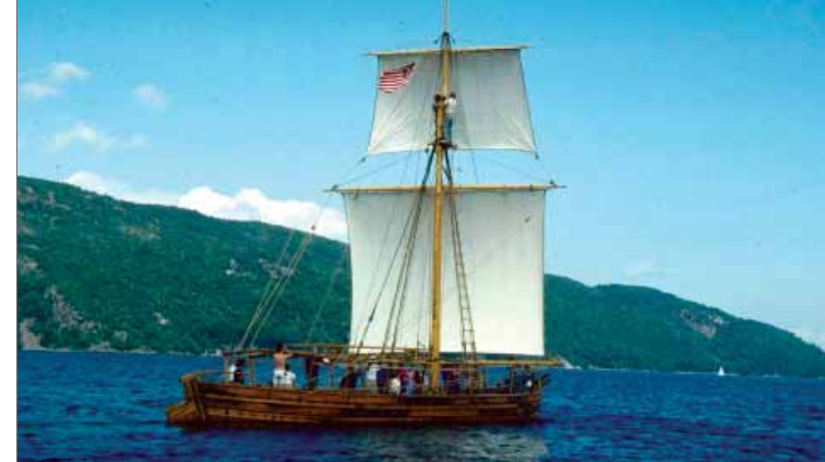
Philadelphia replica under sail

The British overcame the American fleet two days later just below Split Rock. Arnold engaged the British in a running gun battle. Realizing that his battered fleet couldn’t win, he ordered the vessels beached and blown up. Four gunboats and his flagship row galley, Congress , were destroyed and abandoned in Ferris Bay,