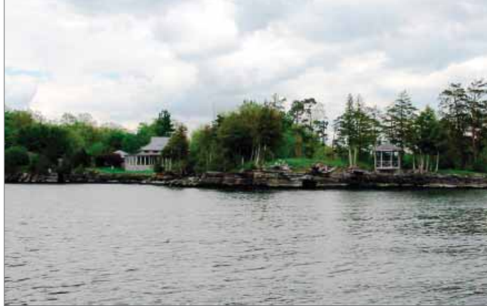
(O) Fort Cassin site, VT

Ethan Allen, the Revolutionary War leader of Vermont’s Green Mountain Boys who captured Fort Ticonderoga, suggested the town be named for the French Minister of Foreign Affairs, Count Vergennes, who helped colonists during the American Revolution and negotiated the 1783 Treaty of Paris. The quaint town, established in 1788, prides itself on being “The smallest city in the USA.”