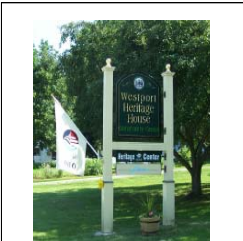
Lakes to Locks Passage Heritage Centers have begun to open along the corridor. Prominently located on the byway, these facilities are designed to be one of the first physical stops people will make when entering the community, and when linked together, they provide connectivity of the byway corridor.

Heritage Center Development Lakes to Locks Passage has developed an authentic "place-based" tourism program that delivers a meaningful experience to the byway traveler by the people who live here. Through a National Scenic Byways Program grant we have been working to develop Heritage Center exhibits