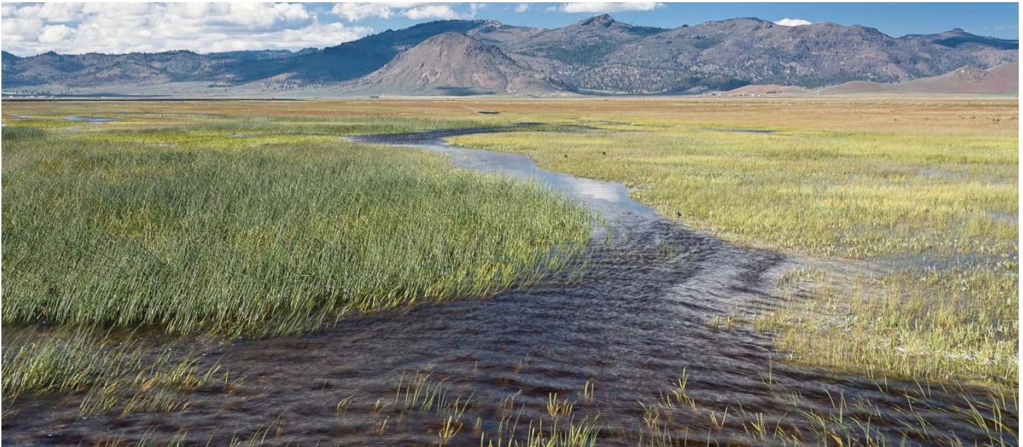
Sierra Valley wetlands.