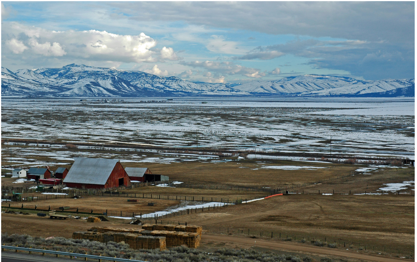
Ranch in Sierra Valley.

The Northern Sierra Partnership (NSP) is a collaborative initiative to conserve, restore, and enhance the magnificent natural landscape of the northern Sierra Nevada, and build the foundation for sustainable rural prosperity.