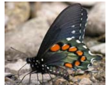
Pipevine Swallowtail Battus philenor

5. Build habitat: Providing water, shelter, and food sources for wildlife can make an important difference! A Smart Garden even lets leaves do the fertilizing, feeding everything from birds to micro-organisms... and saves you time!