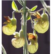
Dutchman's Pipe Aristolochia californica

1. Planting Smart Plants: The foundation of a Smart Gardening landscape is planting local native plants – to restore natural balance. A seasonal succession of native plant flowers, berries and fruit is best for our native birds, bees, butterflies, and other beneficial insects.