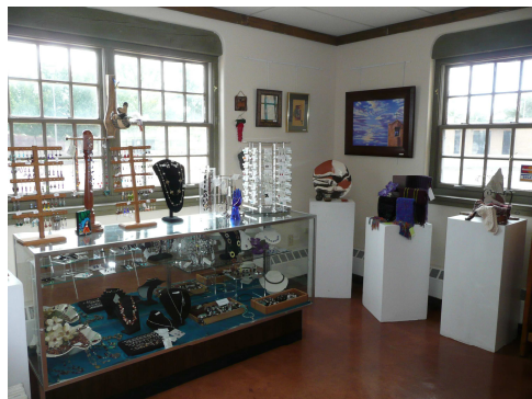
Convento Gallery Gift Shop