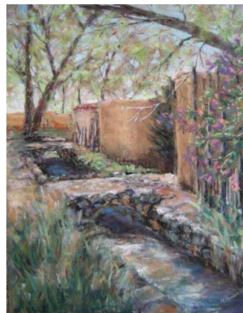
Mary Poweell, Mother Ditch Featured in the exhibition “Water, Water, Everywhere.”

To reach us From Santa Fe take U.S. 285/84 approximately 30 miles to truck route 285/84 (San Pedro Plaza will be on the left). Make a left at the stop light and travel across the Rio Grande River to NM 30. Bear right on NM 30. Make a left at the second traffic light to the Plaza de Española.