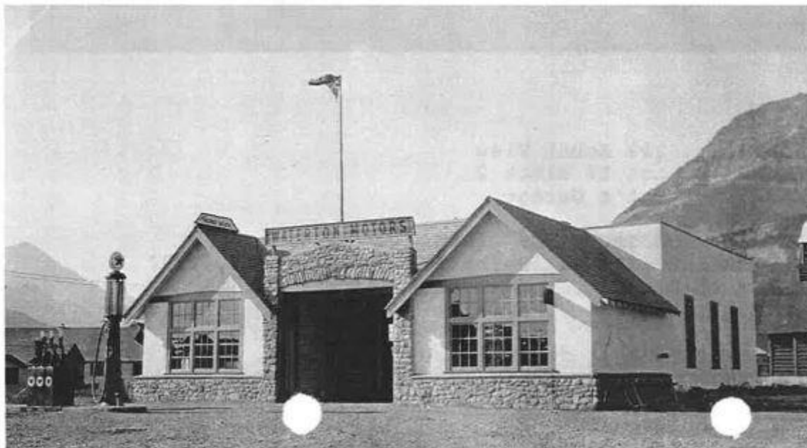
Waterton Motors showing recessed entry circa 1928

This is Waterton’s oldest building that was built to service the growing automobile transportation needs of the community and visitors. Originally named “Waterton Motors”, it was designed in the era when the parks branch architectural division kept a firm control over the design of Waterton construction, insisting on “Tudor-Rustic” or Swiss chalet-themed structures. The center section was originally open, to allow cars to pull right in for servicing.