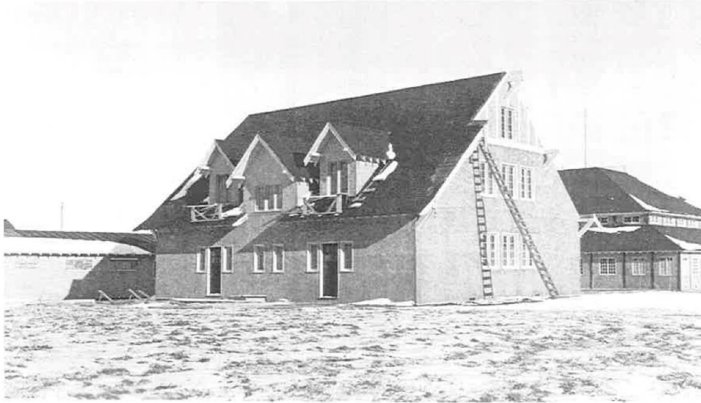
Stanley Hotel During Construction - Rear Facade (Note Waterton Dance Hall in Background)