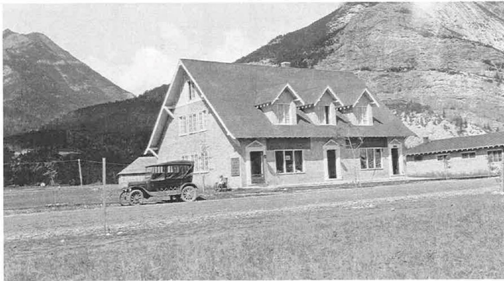
Front Facade of Completed Hotel