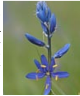
Blue Camas

The 16th annual Wildflower Festival is a unique way to step into a wildflower wonderland. Discover a veritable bouquet of wildflowers in the “Wildflower Capital of Canada”. Home to more than 1,000 vascular plant species, 175 species are listed as rare in Alberta; 20 are found only in Waterton.