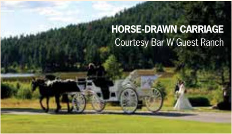
HORSE-DRAWN CARRIAGE

A destination wedding in Whitefish will bring friends and family closer — in an environment that will inspire a lifetime together. Multi-generation family trips and large family reunions will appreciate the diversity of activities for all ages, but the best part is enjoying time relaxing together in a landscape made famous by authors and filmmakers.