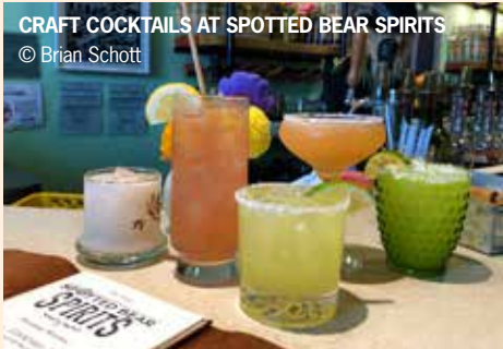
CRAFT COCKTAILS AT SPOTTED BEAR SPIRITS