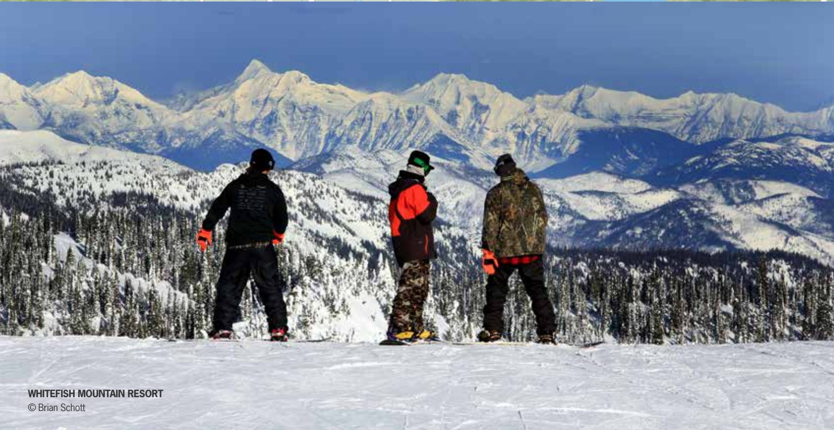
WHITEFISH MOUNTAIN RESORT

Map produced by old town creative communications Copyright © 2017 Old Town Creative Communications LLC & Whitefish Convention and Visitor Bureau Not all roads and trails are shown on this map. Please obey all area closures and signage. Some roads are seasonal or weather dependent. Unauthorized reproduction or use is prohibited.