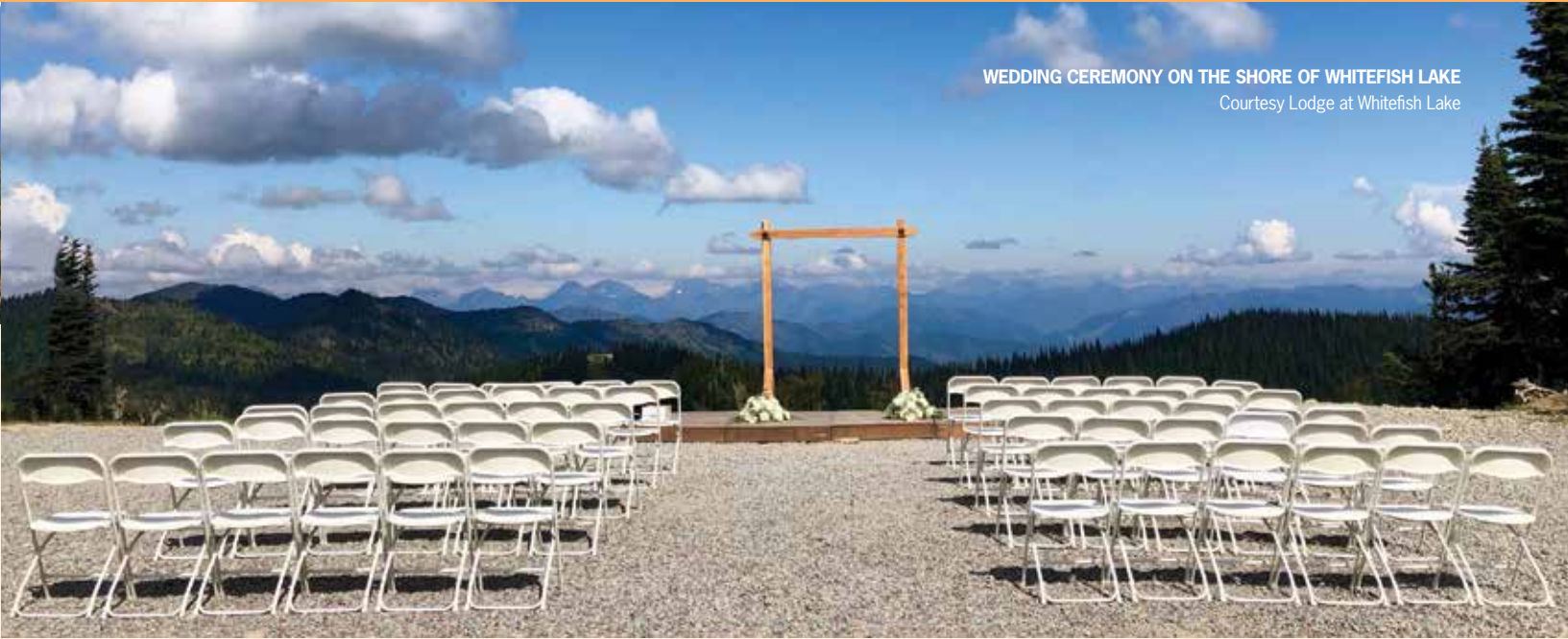
WEDDING CEREMONY ON THE SHORE OF WHITEFISH LAKE

There is no grander place for one of life's greatest moments than the lakes, peaks, and meadows of Northwest Montana.