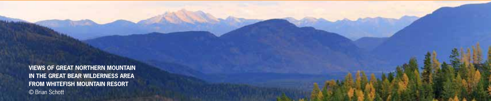
VIEWS OF GREAT NORTHERN MOUNTAIN IN THE GREAT BEAR WILDERNESS AREA FROM WHITEFISH MOUNTAIN RESORT