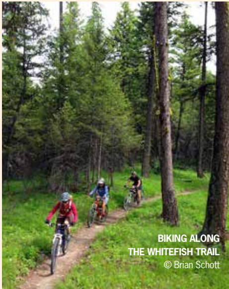
BIKING ALONG THE WHITEFISH TRAIL

Spring Skiing: Late March and early April are superior times to ski and snowboard at Whitefish Mountain Resort. The sun is often shining and the snow is still deep. Though in late spring, you may opt to try golfing at our 36-hole Whitefish Lake Golf Club instead.