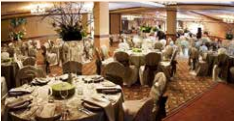
CEREMONY & BANQUET Courtesy Lodge at Whitefish Lake