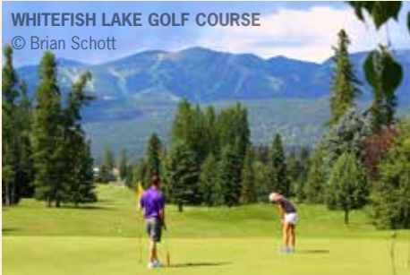
WHITEFISH LAKE GOLF COURSE