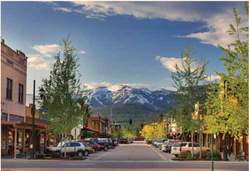
CENTRAL AVENUE, WHITEFISH WITH VIEWS OF WHITEFISH MOUNTAIN RESORT IN THE DISTANCE