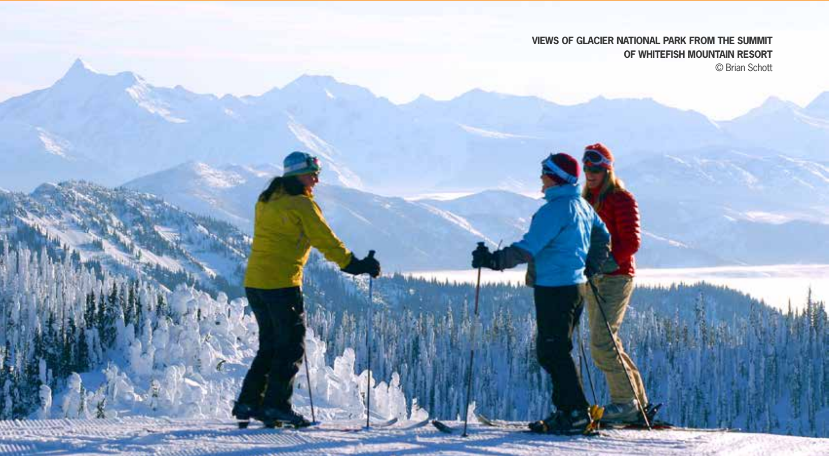
VIEWS OF GLACIER NATIONAL PARK FROM THE SUMMIT OF WHITEFISH MOUNTAIN RESORT

Whitefish is only 25 miles from Glacier National Park, a World Heritage Site, Biosphere Reserve, and the world’s first International Peace Park.