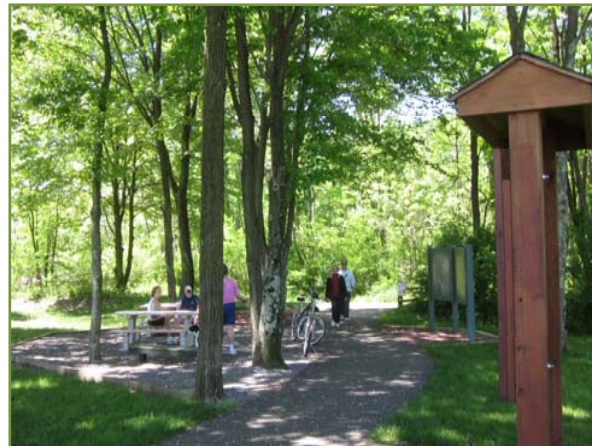
Knitters Hill Road Trail Entrance