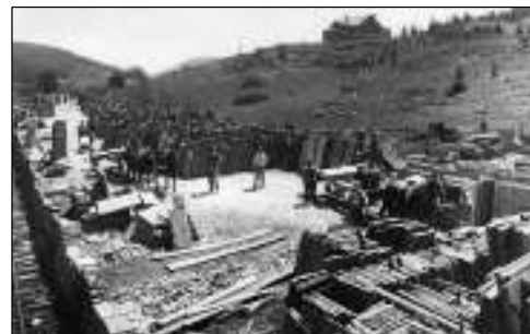
Downsville Stone Dock-D & E Train Station