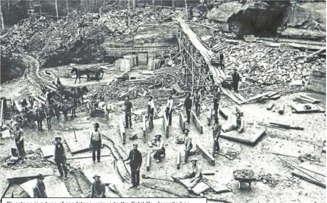
Gregorytown Quarry 1907

Bluestone is a type of sandstone unique to the Catskills, deposited as part of the Catskill Delta. Large stone formations lying just beneath the surface, where the layers can be lifted and cut to size. Quarrymen had to contend with tough, dangerous conditions of weather extremes, isolated locations, dust, bruises and rattlesnakes.