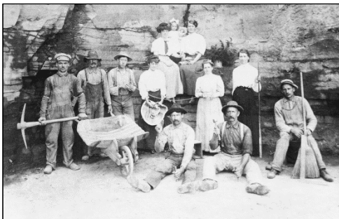
Mink Brook Quarry-Downsville