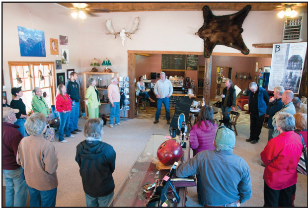
Volunteers are briefed on what to expect during the project at an orientation meeting Monday morning.

"It feels like being invited here you're not just being invited to make work; you're being invited in the adventure of realizing something pretty special. And that nobody's got a preconception of what it might be, it's gonna happen organically, according as the work is made and that's really the best way to do something, you know."