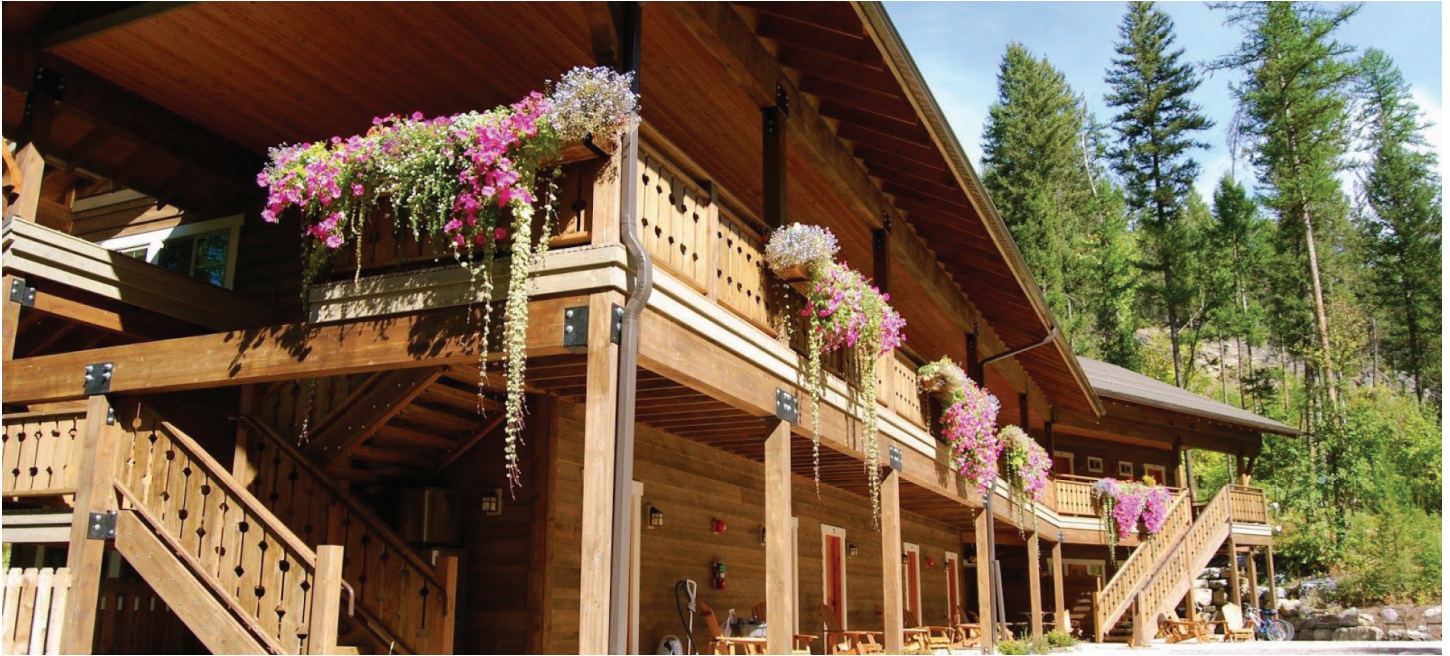
Glacier Guides Lodge in West Glacier, Montana