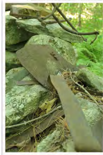
The landscape is speckled with huge glacial-erratic boulders dropped by the last ice age.