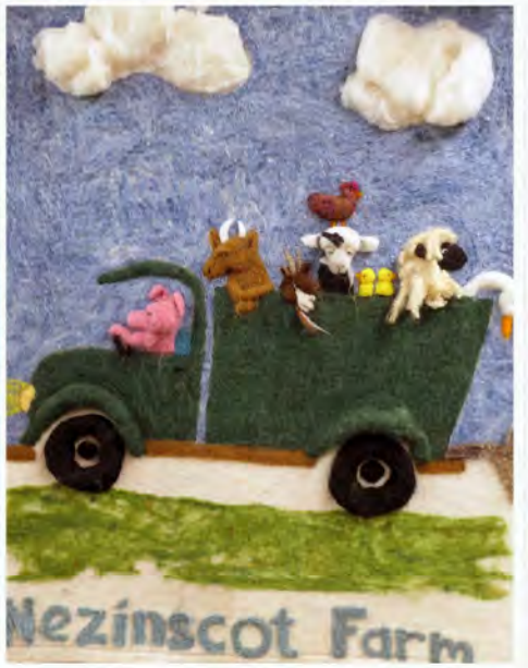
The entire second floor is dedicated to fiber arts.