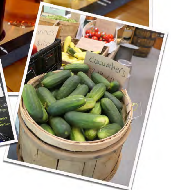
Ricker Hill Farmstand a short walk from the Tasting Room.