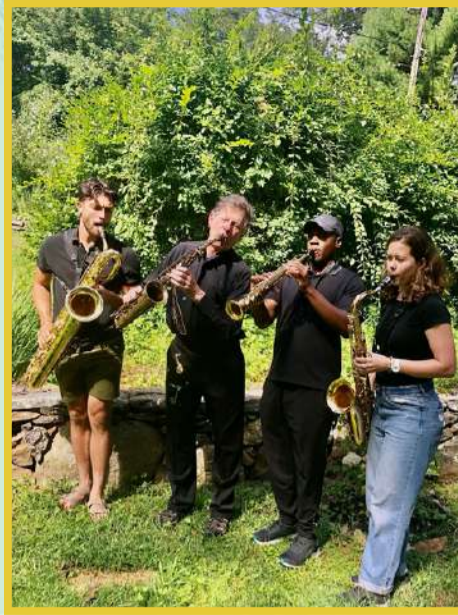
7/12 at 5 PM: BROKEN REED SAX QUARTET