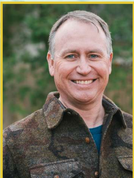
8/8: AUTHOR TALK WITH PAUL DOIRON