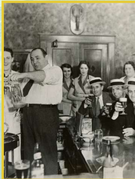
8/22: MURDER MYSTERY AT THE LIBRARY

GO TO ELLSWORTH LIBRARY.NET FOR MORE DETAILS