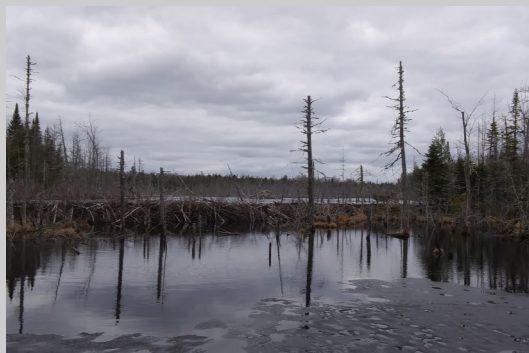
Our operational area is a perfect mix of boreal forest, cedar bogs and cropland

The northern and eastern ranges of Maine hold the highest numbers of bears and our location at the joining of Penobscot, Washington and Aroostook counties makes for world class black bear hunting habitat.