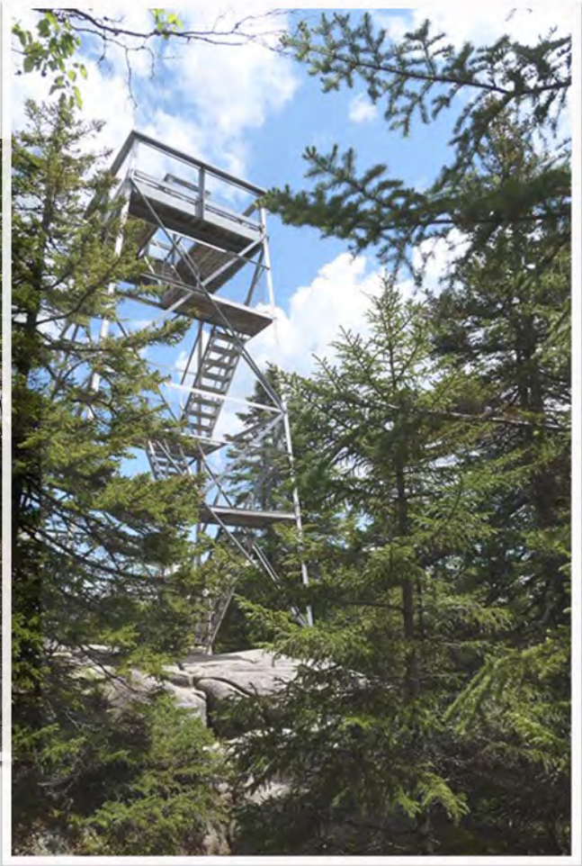
A forest service tower stands sentinel over the vast Maine woods of the region.