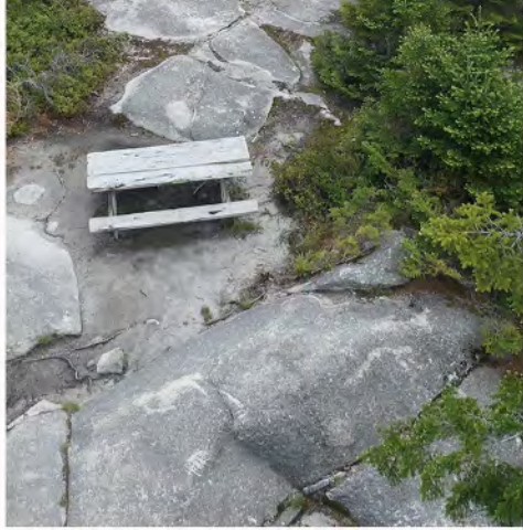
Climb up and enjoy an exceptional, panoramic view of this corner of the state.

Visit for a day hike to the top of 2,433 foot Bald Mountain , one of Maine's Public Reserved Lands . Not far from Haines Landing on the Bald Mountain Road, the parking lot is well-signed. The trail is well-marked with blazes and starts with a gradual climb then turns into a non-technical steeper climb to the summit. It's not a long hike but it is challenging, so bring some extra water and snacks. It's quickly evident why this area has been a mecca for many generations of outdoor enthusiasts. The hike down seems to fly by, leaving plenty of time to explore Oquossoc Village.