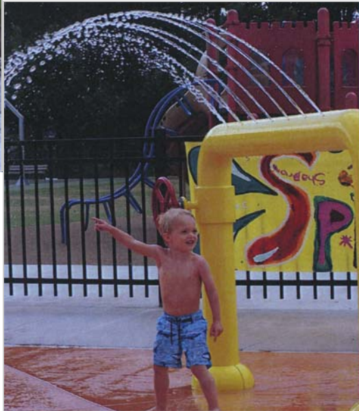
Cross Bar Jet