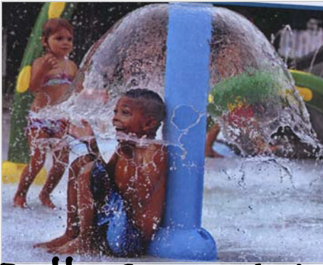
Belle Spray Jet