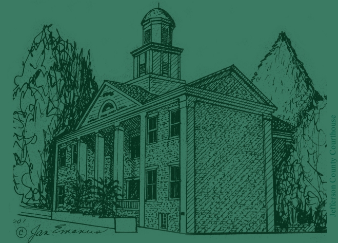
Jefferson County Courthouse

Historic Dandridge—Located in the Heart of East Tennessee